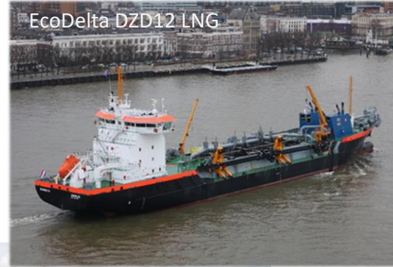
EcoDelta DZD12 LNG