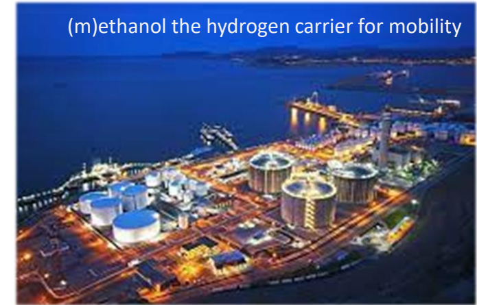
(m)ethanol the hydrogen carrier for mobility