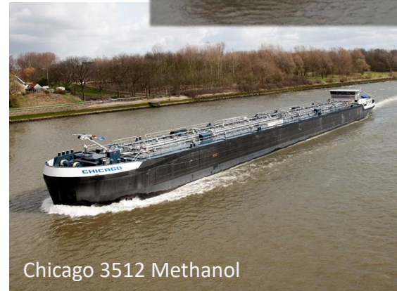
Chicago 3512 Methanol