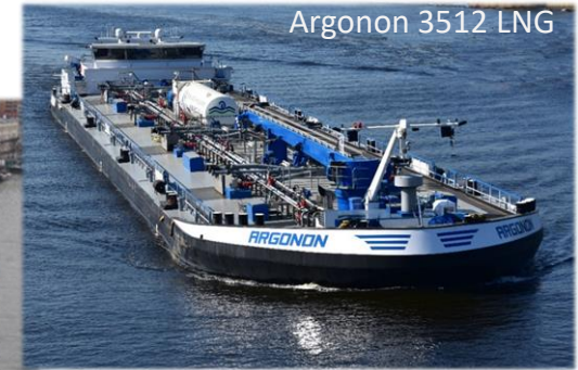
Argonon 3512 LNG